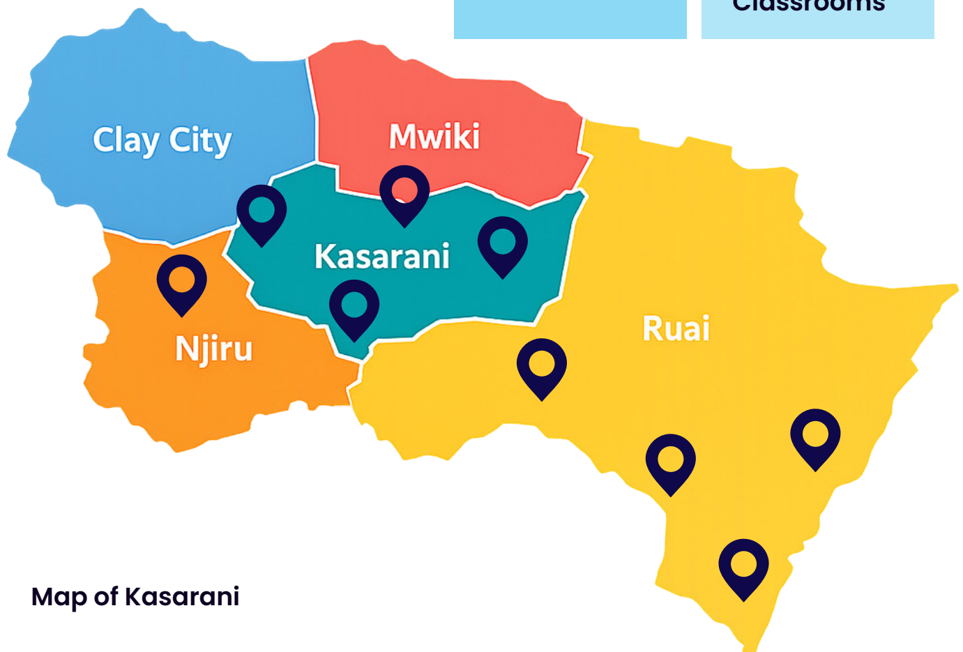
Map of Kasarani

Reducing classroom congestion and improving learning environments.